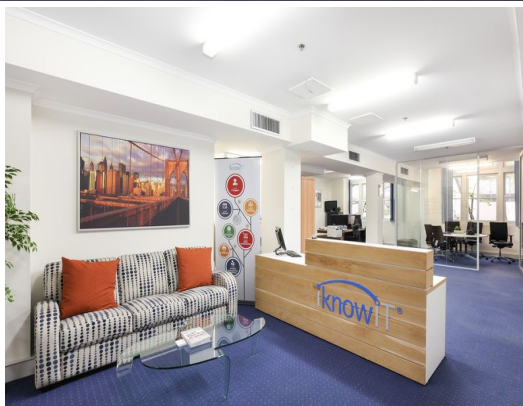
C15, 372-428 Wattle Street, ULTIMO