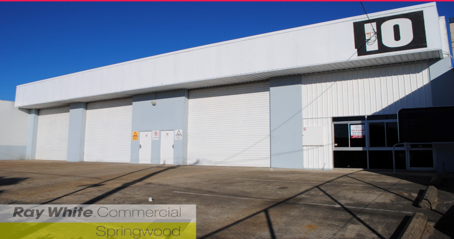
Ray White Commercial Springwood