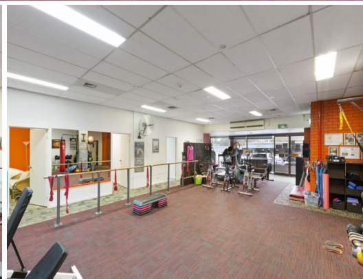
9B/112 JAMES STREET TEMPLESTOWE