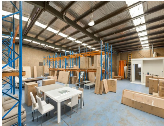
3/194-196 WHITEHORSE ROAD, BLACKBURN