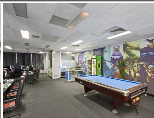
1A/ 501-509 High Street, PRESTON