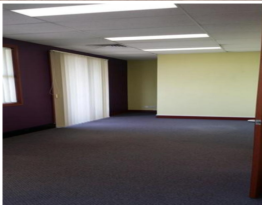
Building 5, 12 Torbey Street, SUNNYBANK HILLS