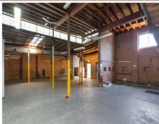
Unit 1 & 3/ 5 Stanley Street, PEAKHURST