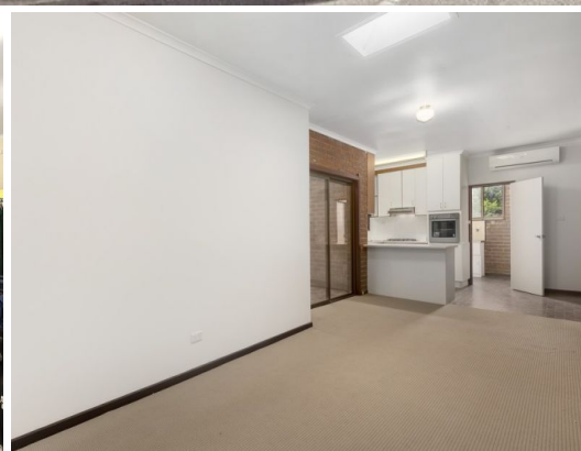
25 & 25A WORRELL STREET, NUNAWADING