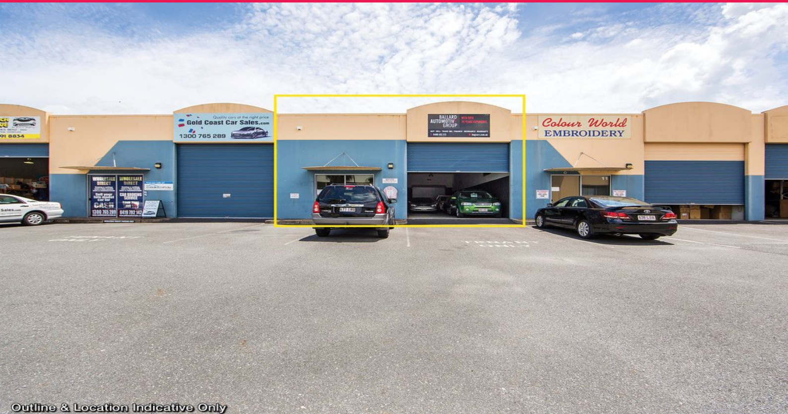
Outline & Location Indicative Only