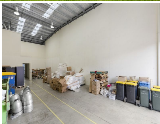
5A/4 ROCKLEA DRIVE, PORT MELBOURNE