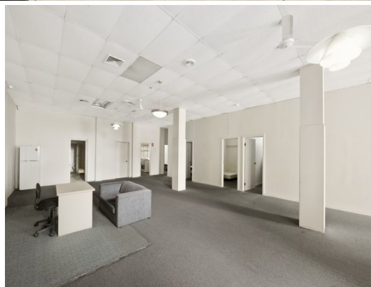
1032 DANDENONG ROAD, CARNEGIE