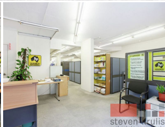
4/29 Newland Street, BONDI JUNCTION