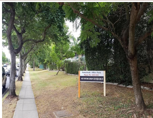
Building 9, 18 Torbey Street, SUNNYBANK HILLS