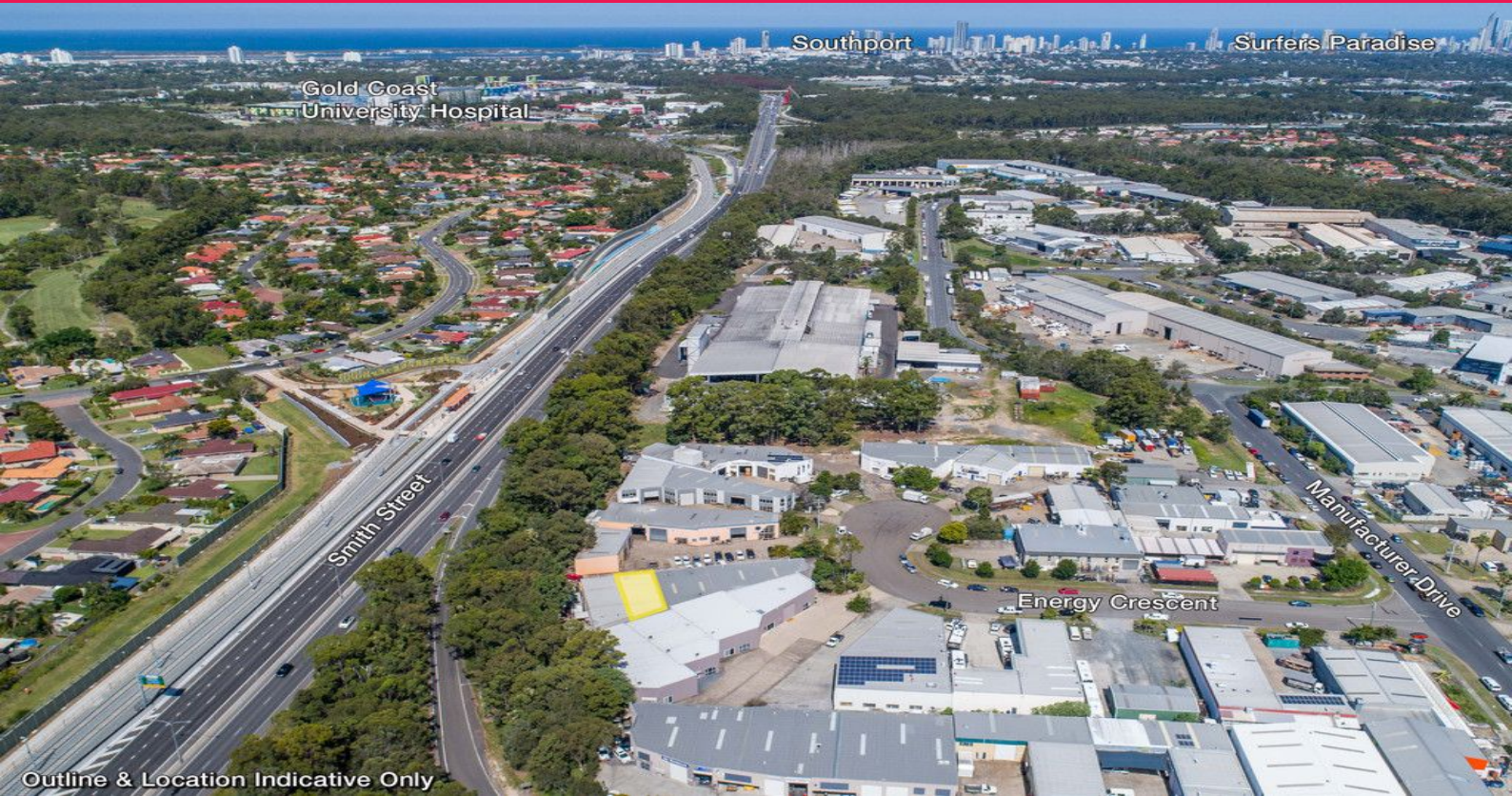
Outline & Location Indicative Only