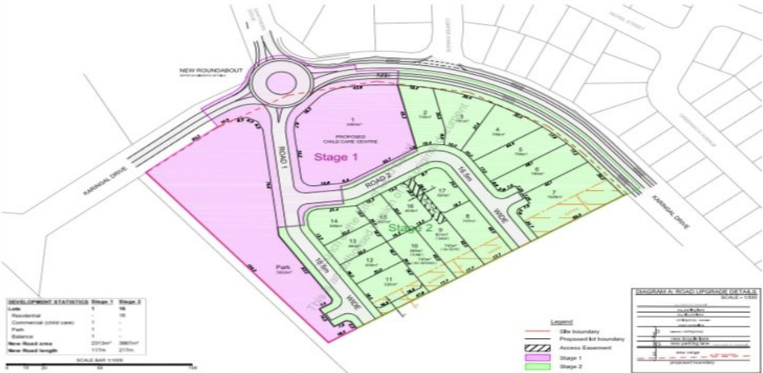
Proposed Staging Plan 1 into 17 lots in 2 stages Cancelling Lot 20 on RP152380 30 Karingal Drive PIMPAMA

HPC urban design + planning urban design + planning