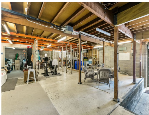
65 Middleton Road, Crows Nest