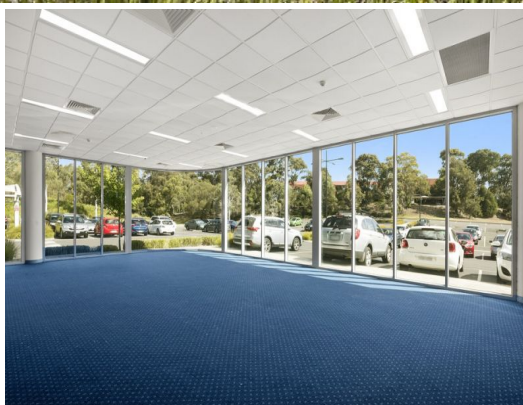
8/1 EAST RIDGE DRIVE, CHIRNSIDE PARK