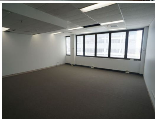
332-342 Oxford Street, BONDI JUNCTION