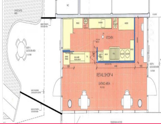
Shop 4/9-15 Ascot Street, Kensington NSW 2033