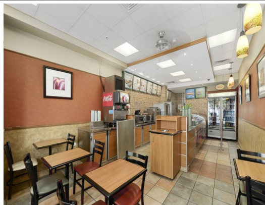
1/528 VICTORIA STREET, NORTH MELBOURNE