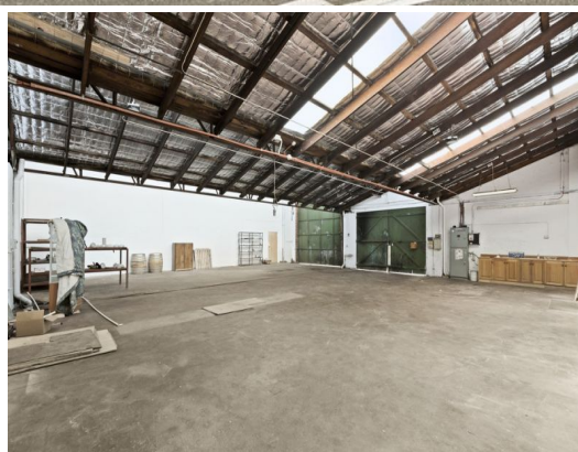
1/25 PERCY STREET, HEIDELBERG WEST