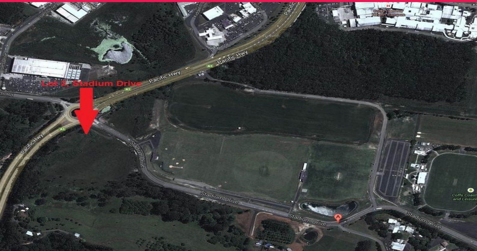
Lot 2 and 3, DP1037158, Stadium Drive, Coffs Harbour South