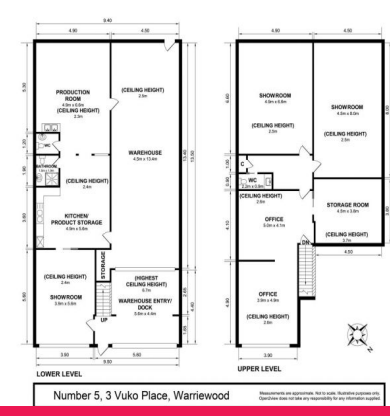
5/3 Vuko Place, Warriewood NSW 2102