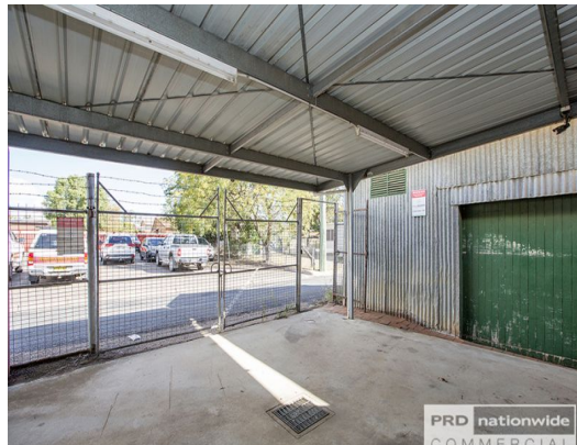
172-174 Bridge St, West Tamworth