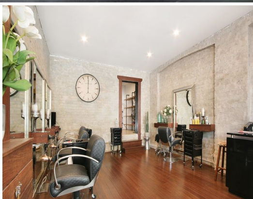
565 Crown Street, SURRY HILLS