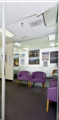
Level 3, 332-342 Oxford St, Bondi Junction