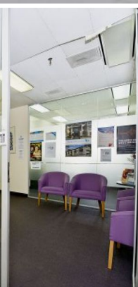
Level 3, 332-342 Oxford St, Bondi Junction