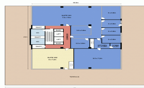
Level 3/332-342 Oxford Street, BONDI JUNCTION

This floor plan is intended as a guide only. Layout dimensions are approximate only. All measurements are subject to verification of any future developments and shown or intended. All dimensions shown are for information only and are not to be used for any other purpose.