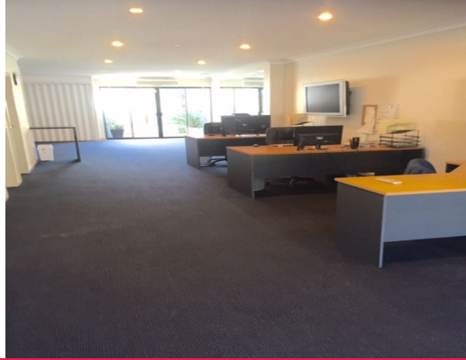
Gf/75 Justin Street, Lilyfield NSW 2040