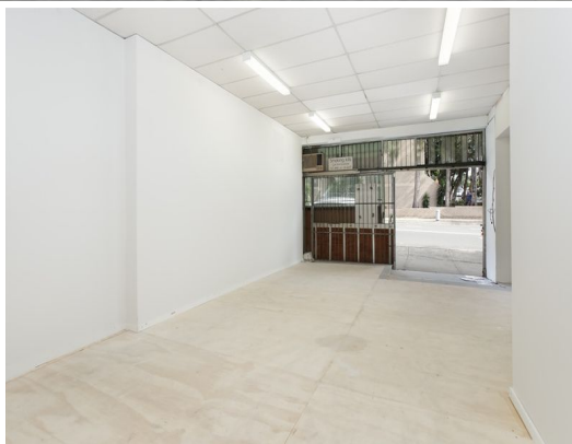
2-6 Flood Street, BONDI