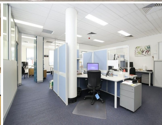
Suite 201, 12 Butler Road, HURSTVILLE