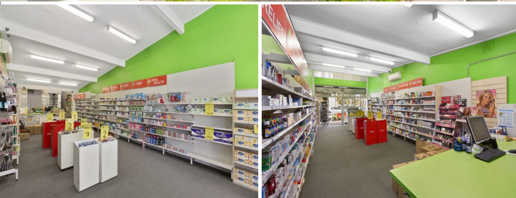
1 MORESBY COURT, HEIDELBERG WEST