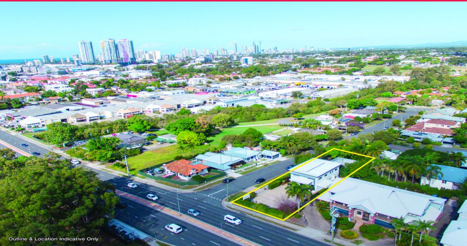
Outline & Location Indicative Only