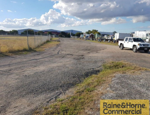
515 Boundary Road, Archerfield QLD 4108