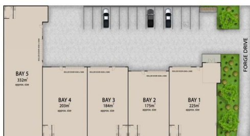
Lot 121 Forge Drive, Coffs Harbour