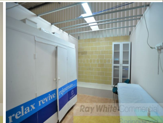
Ray White Commercial Springwood