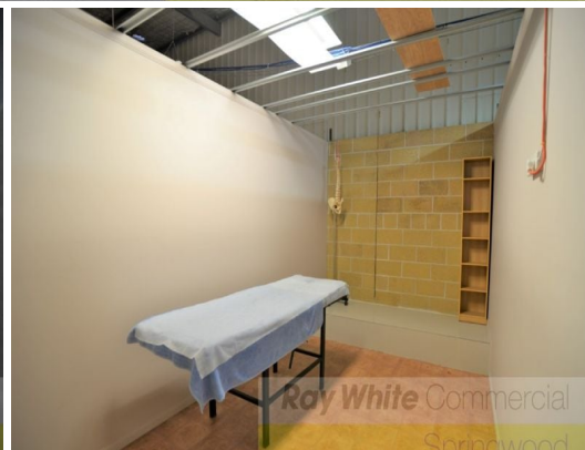
Ray White Commercial Springwood