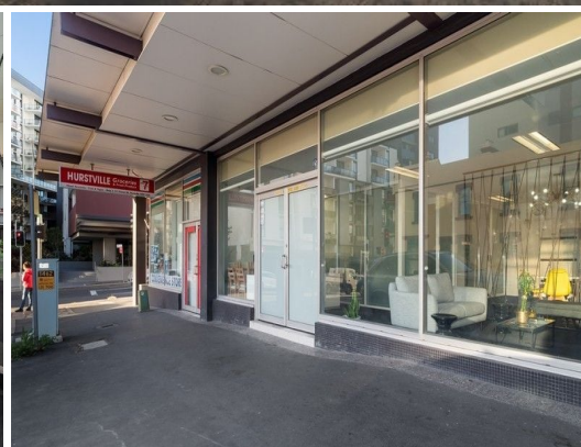
Shop 5/313 Forest Road, HURSTVILLE