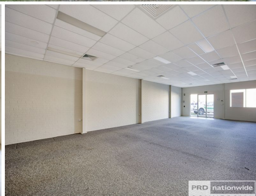
Shop 4, 164 Peel St, Tamworth (Entry Via Bligh Street)