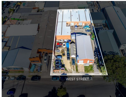
15-17 West Street, Brookvale