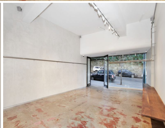
35 Elizabeth Bay Road, ELIZABETH BAY