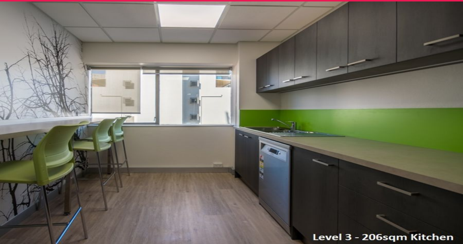
Level 3 - 206sqm Kitchen