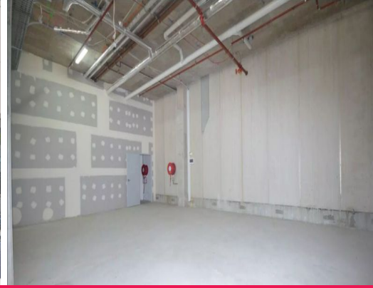
Shop 1, 564 Princes Highway, Rockdale NSW 2216