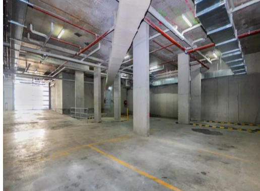
Shop 2, 564 Princes Highway, Rockdale NSW 2216