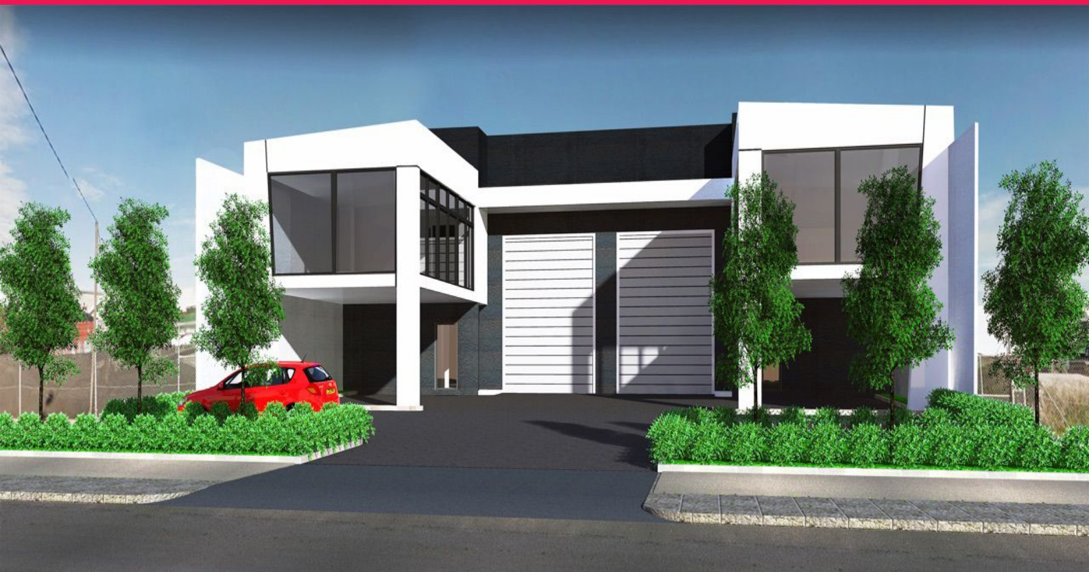
WAREHOUSE 1&2 39 Albermale Street, Williamstown, North VIC 3016