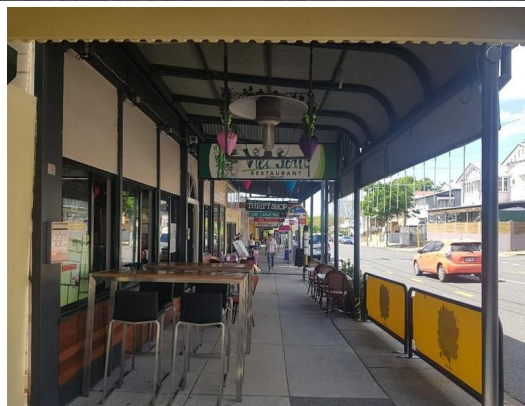
93 Hardgrave Road, WEST END