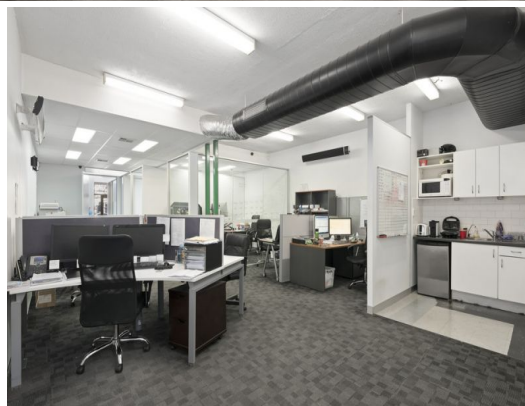
632 QUEENSBERRY STREET, NORTH MELBOURNE