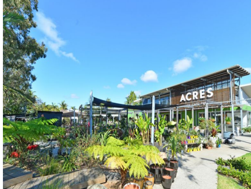
Shop 1a/37 Gibson Road, Noosaville QLD 4566