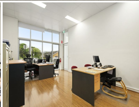
1/2B BEAUMONT STREET, VERMONT