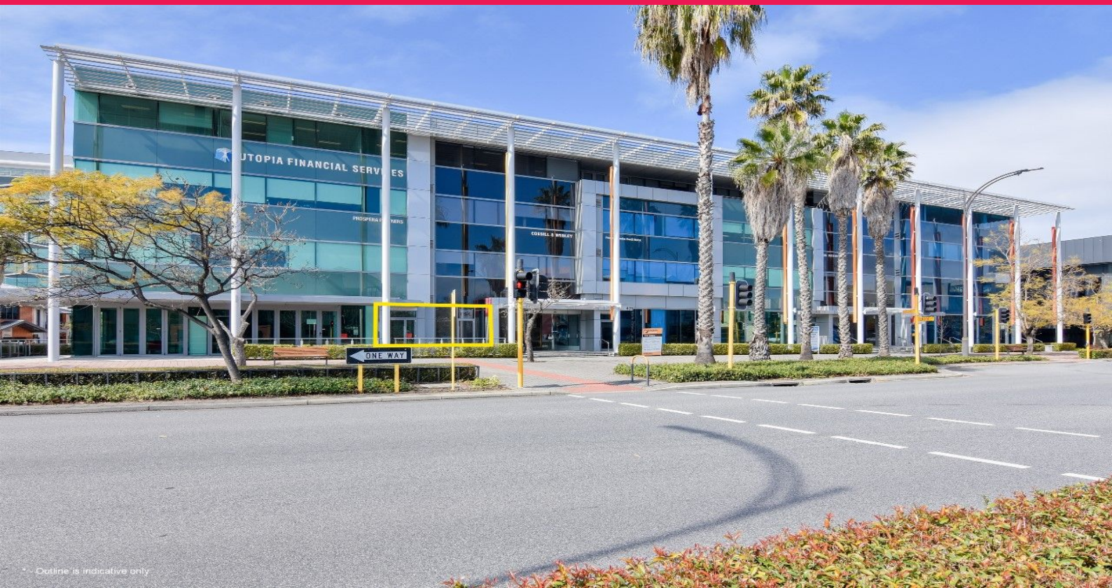
* Outline is indicative only