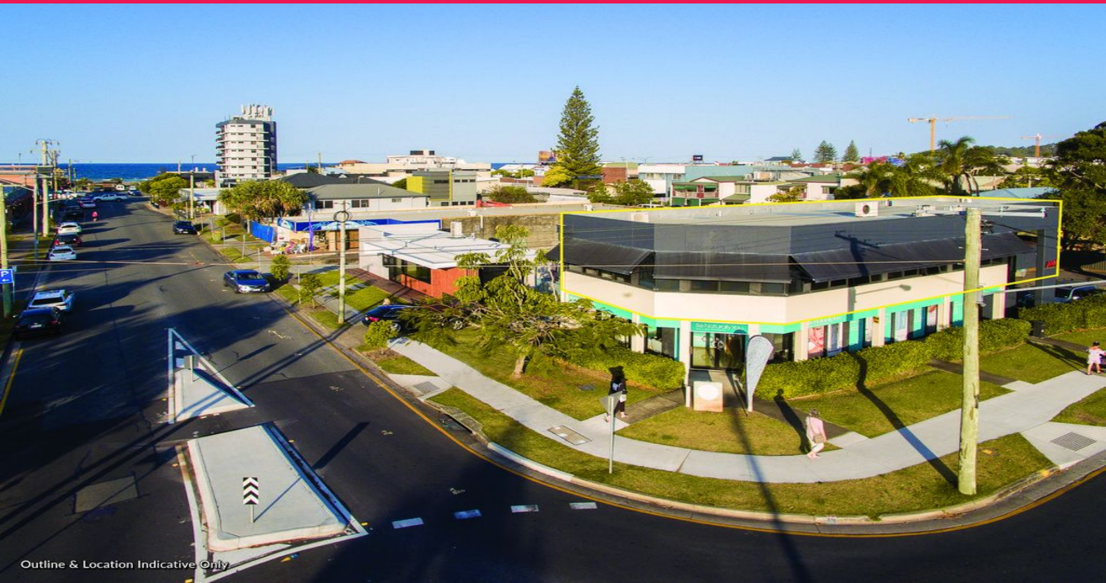
Outline & Location Indicative Only