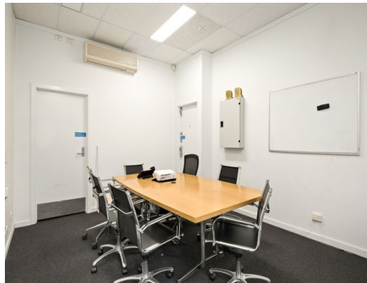
2A MONOMEETH DRIVE, MITCHAM